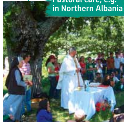
Pastoral care, e.g. in Northern Albania

The spectrum of projects is extremely diverse. It ranges from material support for priests and religious, the education of deacons and catechists, day-care centers for disadvantaged children and young people, nursing and care homes to trainings, workshops and scholarships.