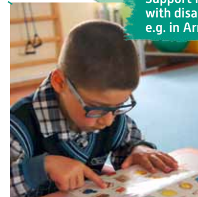
Support for children with disabilities, e.g. in Armenia