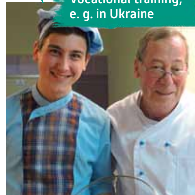
Vocational training, e.g. in Ukraine