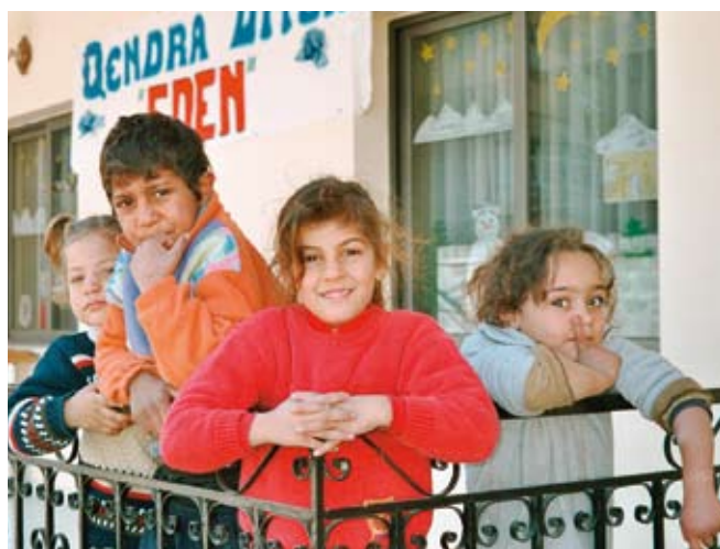
Albania: Assistance for street children in the day-care center "Eden" in Tirana.

Renovabis's projects in the countries of Central, Eastern and South-Eastern Europe are developed in close cooperation with partners in the field and are therefore oriented on their needs and possibilities.